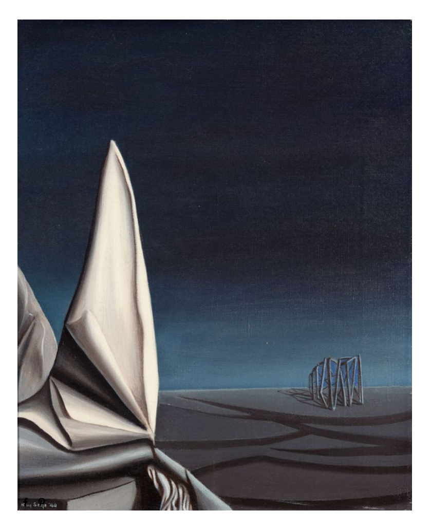
Kay Sage, Midnight Street , 1944.

Intrigued by the shamanistic ritualism and transformational aspirations of Yup'ik mask making, the Surrealists found new ways to express their own interest in dream imagery, mysticism, and psychic exploration. According to Ellis, every year new mask designs were envisaged by shamans, who then related them to a mask maker. Often combining animal and human characteristics, the completed masks were worn by dancers, who became conduits between the physical and spiritual worlds to guide hunters to food in the dark, sunless days and cold, moonlit depths of the Alaskan winter.