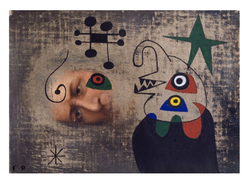
Joan Miró, Personnage dans la nuit , 1944.

This powerful relationship with nature is evident in a trio of works. A circa 1900 Yup'ik mask depicting a round seal face with large, deep, vacant eyes is displayed near a rectangular bronze sculpture by Max Ernst from 1960 that boasts a lunar-like orb bearing eyelike depressions that hauntingly resemble the mask. A glittering scene painted by Leonora Carrington in 1950, meanwhile, features half-abstracted figures in various attitudes of ecstasy or action that filter the foreground of a flattened and desolate landscape under a gold-leaf moon that hovers against a red sky, much like Ernst's cold seal-eyed moon.